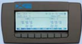
Semi-graphic user terminal with multifunction keys and dynamic icons.