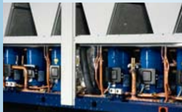
Optimisation of performance thanks to the multiscroll logic.