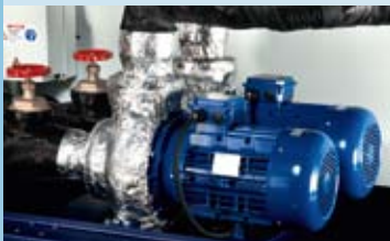
Pump section with or without storage tank.