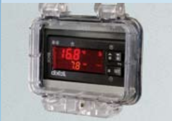
Microprocessor controller with dual icon-based display.