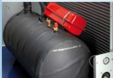
Built-in pumping module with or without storage tank.