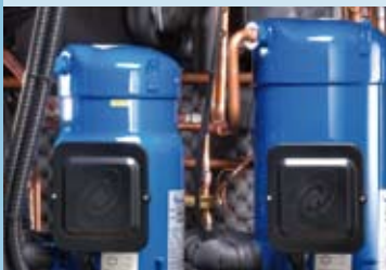
Higher efficiency and quieter operation thanks to scroll compressors.